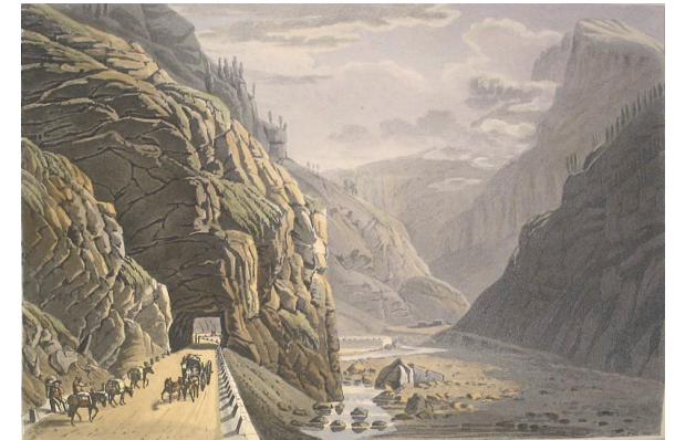
Entrance to the Gondo Ravine